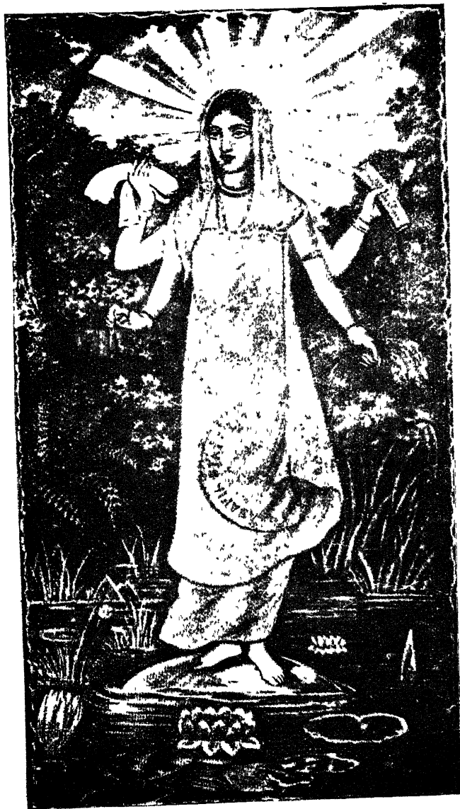
INDIA THE MOTHER