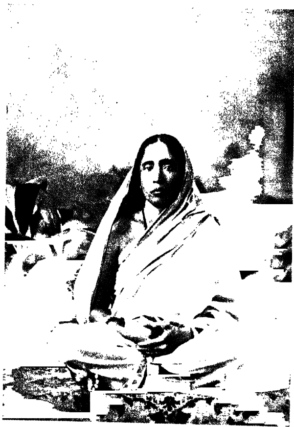
The Holy Mother