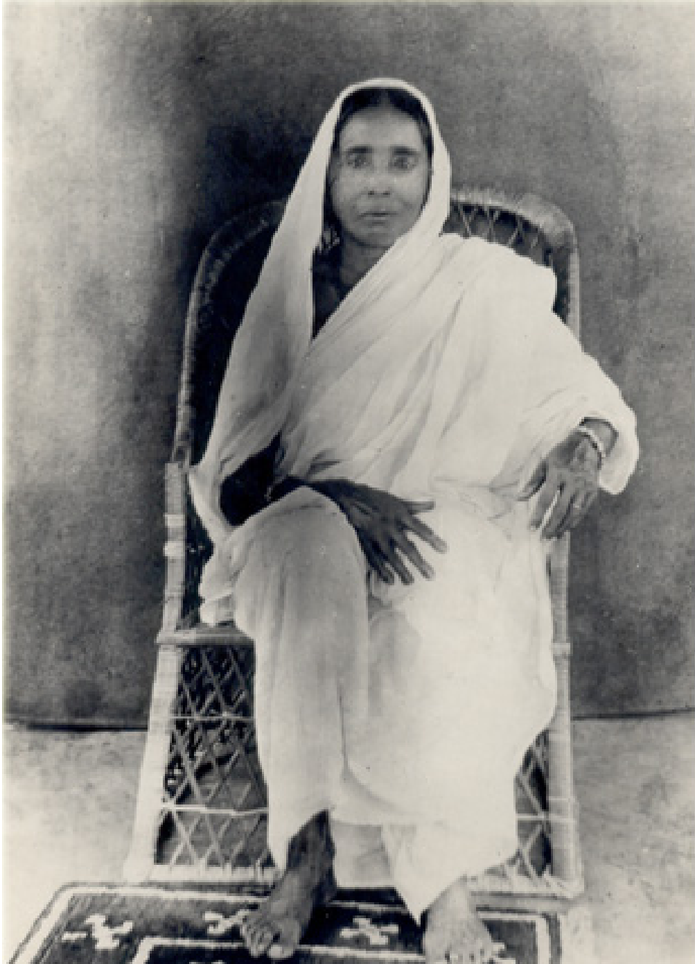
This photograph was taken at Baghbazar, Kolkata circa 1905.