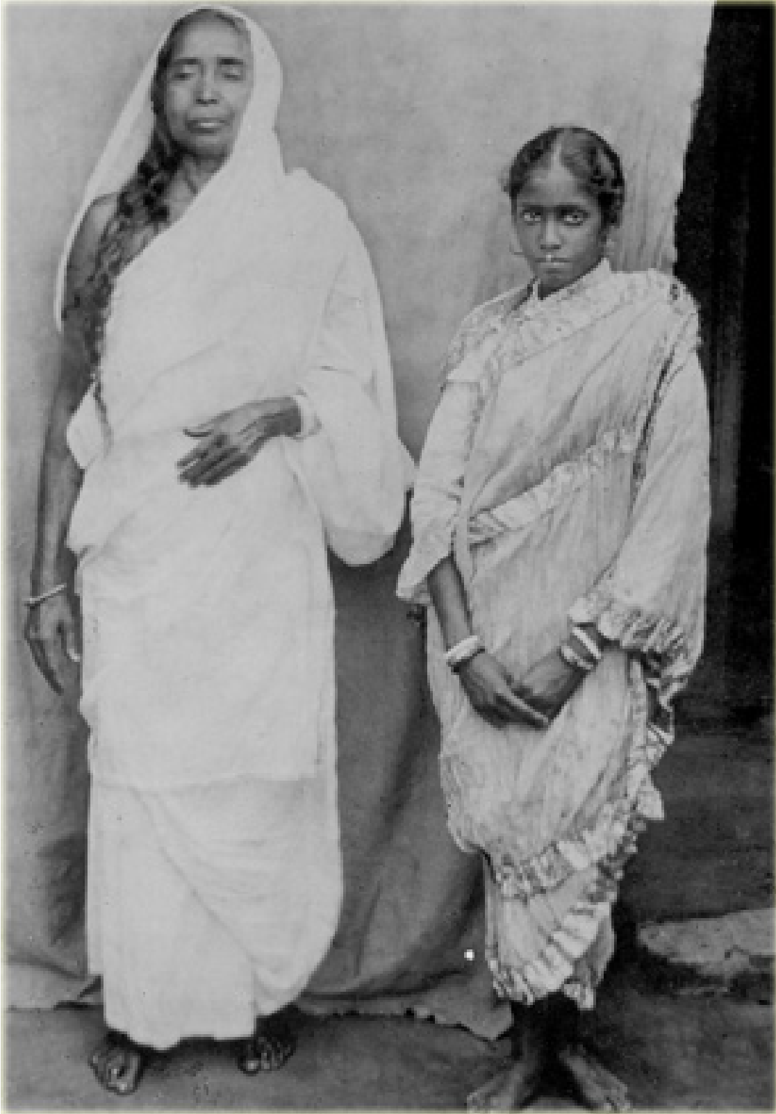
This photograph of the Holy Mother and Radhu was taken by Brahmachari Ganendranath at Jairambati of the Bengali calendar 1324 and 1918 A.D.