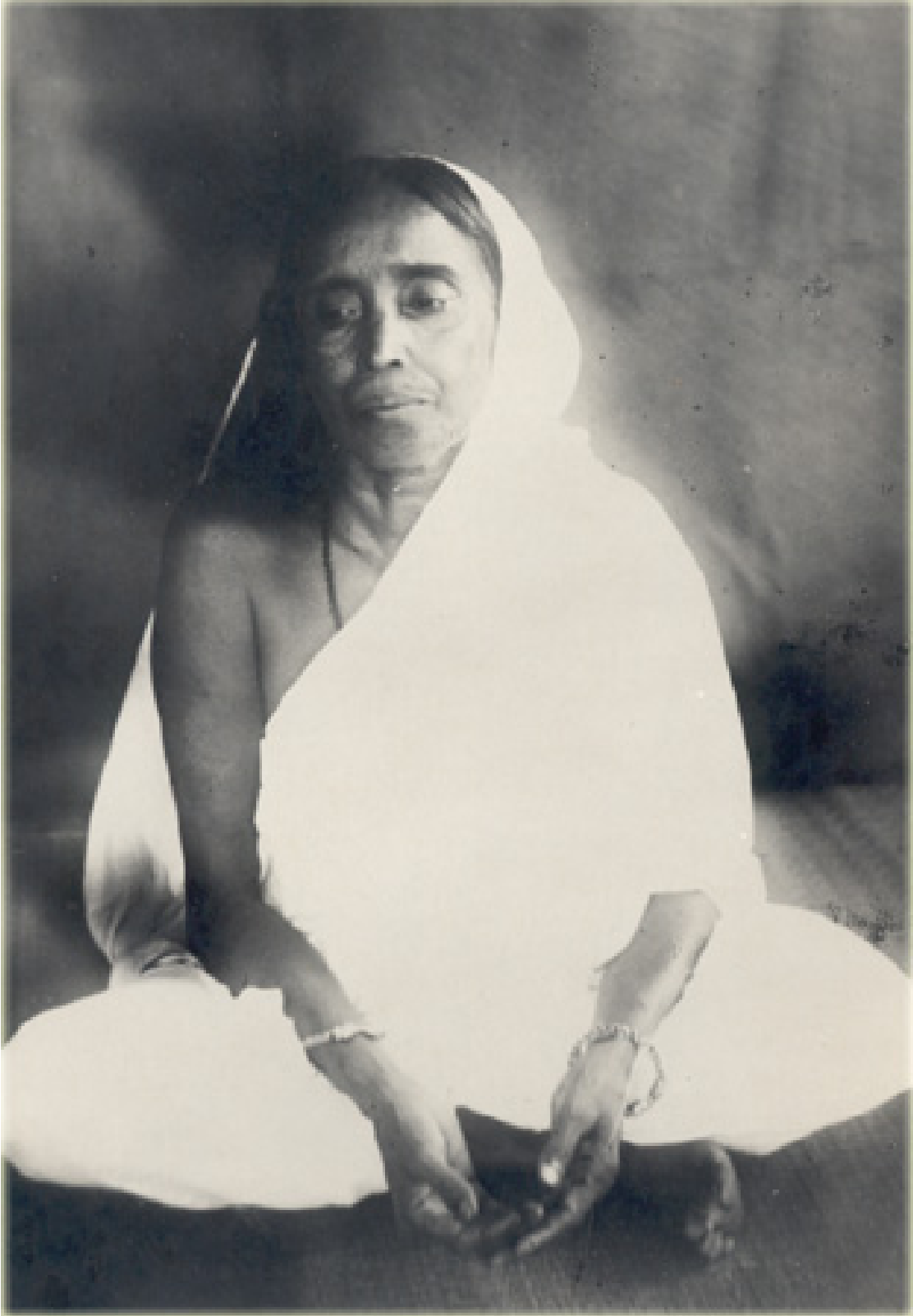
at Udbodhan in Bengali year 1316 and 1909 A.D.